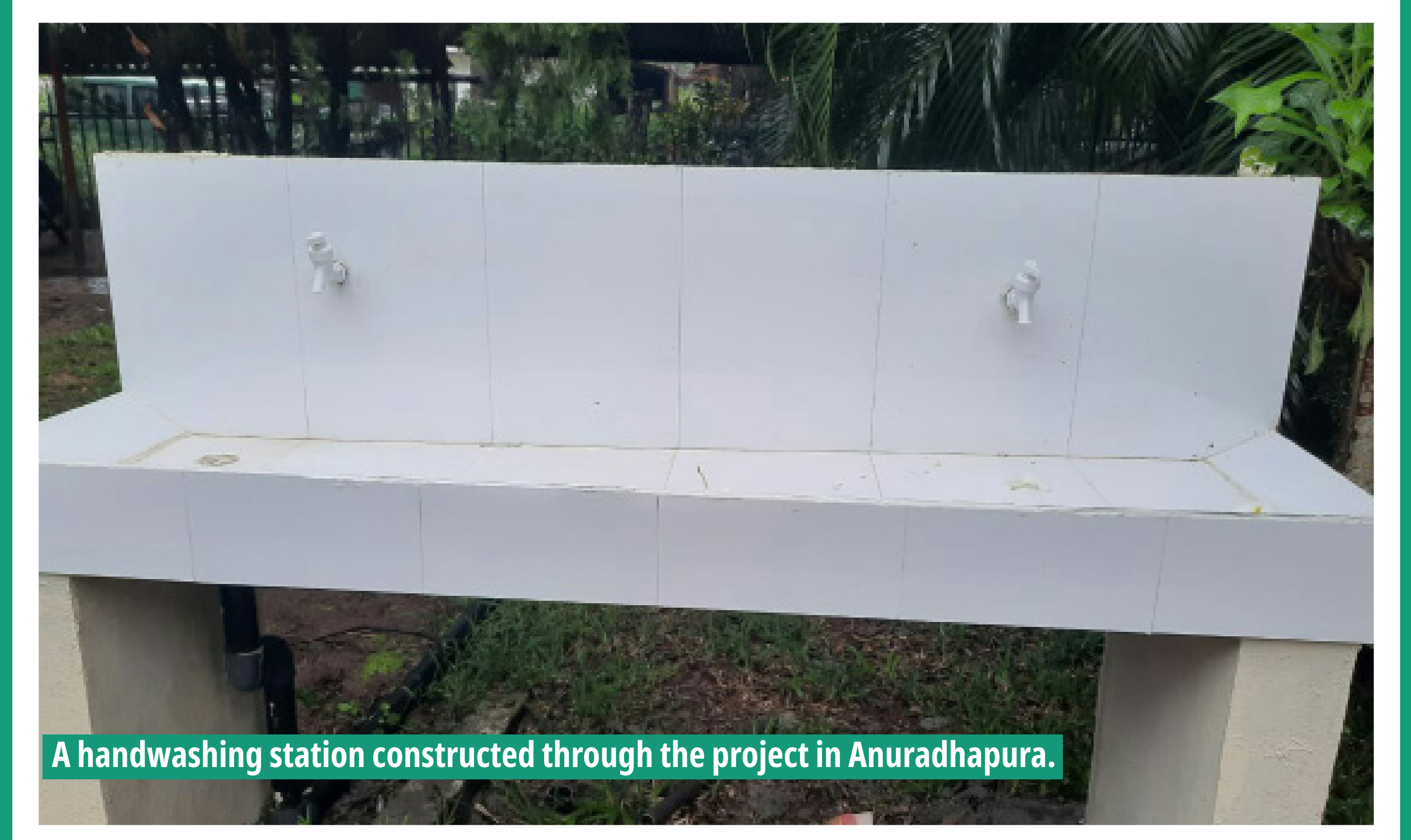
A handwashing station constructed through the project in Anuradhapura.

Through the recently concluded Building Resilience in Communities and Societies (BRICS) project, ADRA Sri Lanka partn-