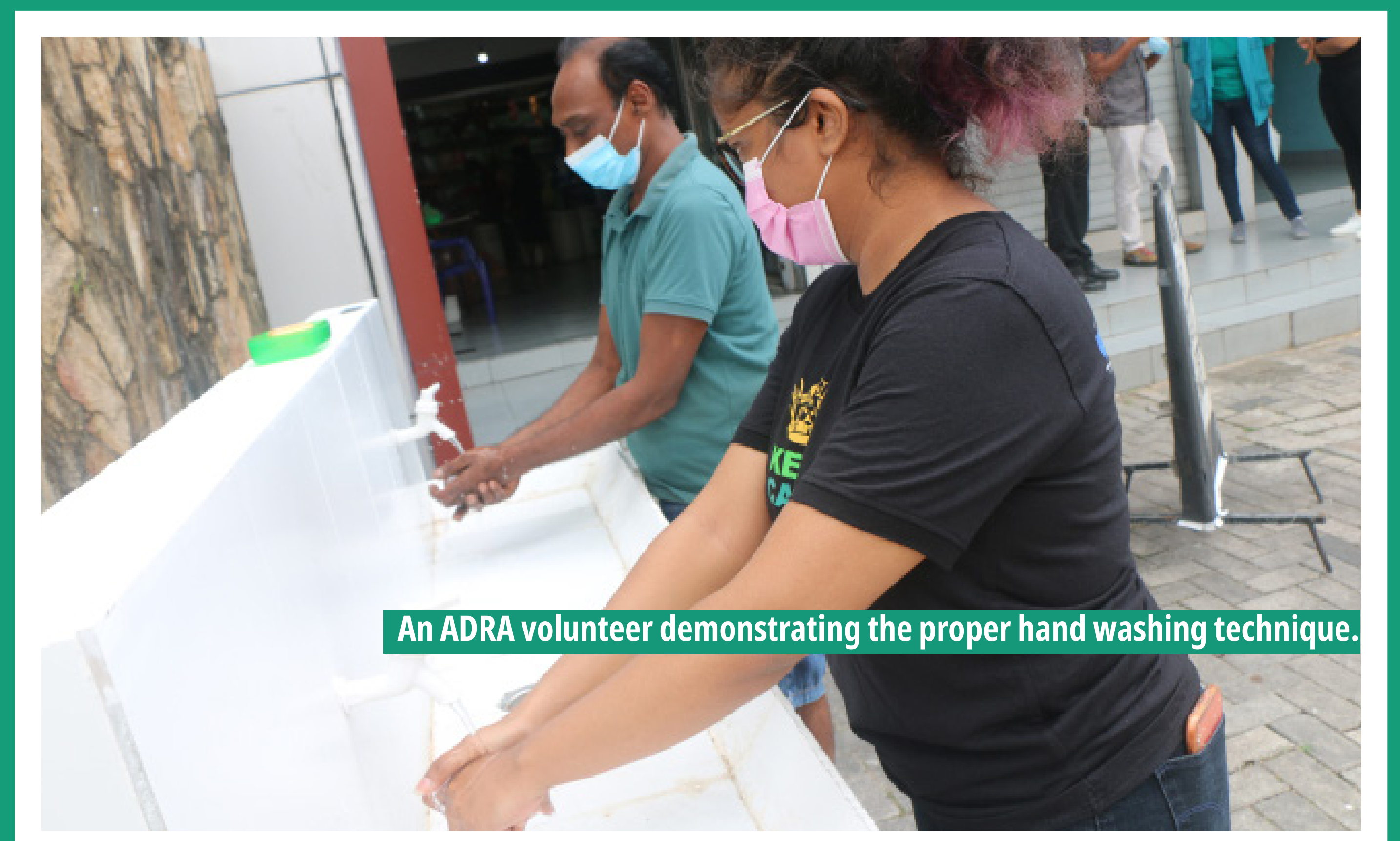
An ADRA volunteer demonstrating the proper hand washing technique.

As part of the project, ADRA also took the initiative to create awareness regarding the importance of hand-washing through various approaches. ADRA has displayed IEC boards in the stations to promote and reinforce hand-washing among the general public. Furthermore, ADRA conducted an awareness campaign in Nugegoda and Vavuniya towns, where a group of volunteers and staff from ADRA visited the hand-washing stations to create awareness and encourage the public to frequently and properly wash their hands with soap. Through the campaign the volunteers reached more than 50 random individuals and shared with them the importance of washing hands, and also demonstrated the proper technique prescribed by the World Health Organization.