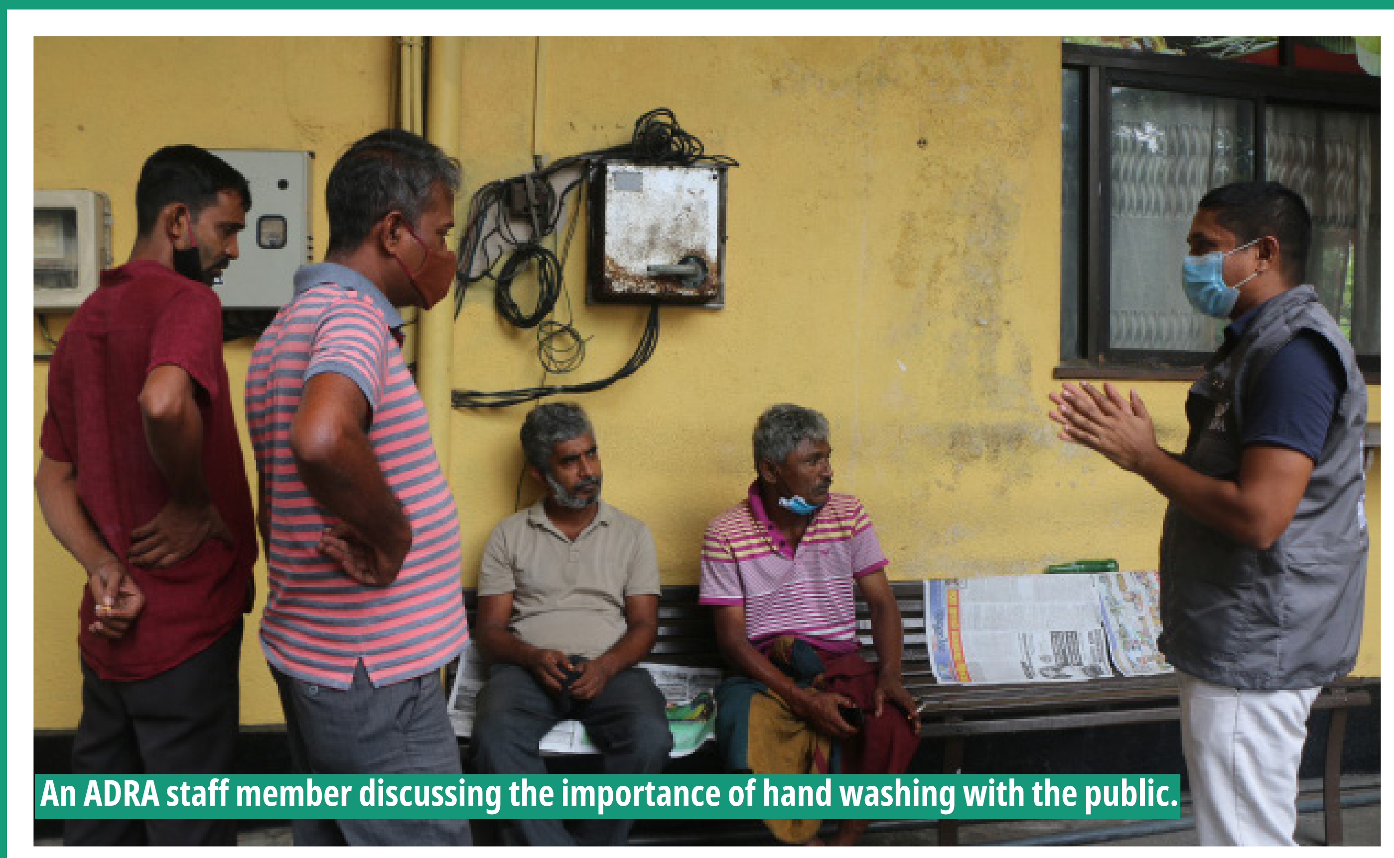
An ADRA staff member discussing the importance of hand washing with the public.

ered with UNICEF and ADRA International to promote hand-washing among the general public through provision of hand-washing facilities. The project has altogether constructed 100 hand-washing stations in public locations such as railway stations, bus stands, industrial centers and economic centers within Colombo, Anuradhapura, Vavuniya and Kilinochchi districts.